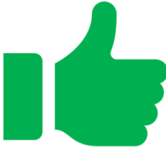
Example of a properly packed bin